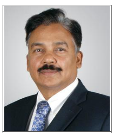
President Financial Technologies Knowledge Management Co.Ltd.

An important aspect of financial education is that it emerged as a priority for developed and developing markets notwithstanding huge differences and diversities in the nature, scope and significance of financial markets. Financial Education and Literacy have assumed equal urgency and importance and are given great thrust and focus in numerous countries ranging from Russia to the United States.