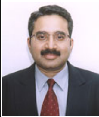
Joseph Massey Dy. Managing Director Multi Commodity Exchange of India Ltd.

The Government of India, in an effort to revitalize the commodity futures markets in the year 2002-03, lifted the ban on futures trading in commodities. Following this, the Government of India mandated three nation wide multi commodity online exchanges during 2002-03. Currently, the national level exchanges are providing futures trading in over 100 commodities including,